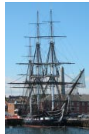
Old Ironsides, Boston